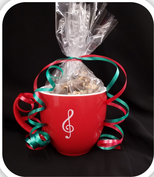
Mug with Salt Water Taffy: $15.00

We are pleased to offer the wonderful confections of Colorado Springs' very own Patsy's Candy! The music mug will be filled with your choice of Salt Water Taffy or Assorted Preludes.